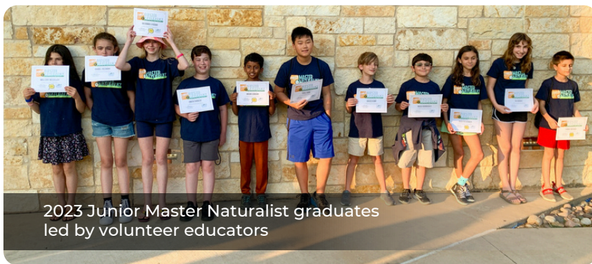
2023 Junior Master Naturalist graduates led by volunteer educators