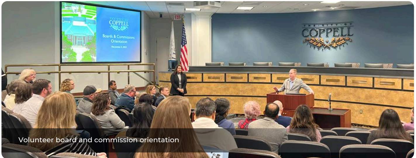
Volunteer board and commission orientation