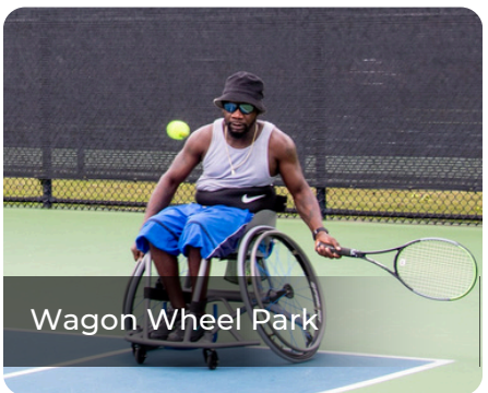
Wagon Wheel Park