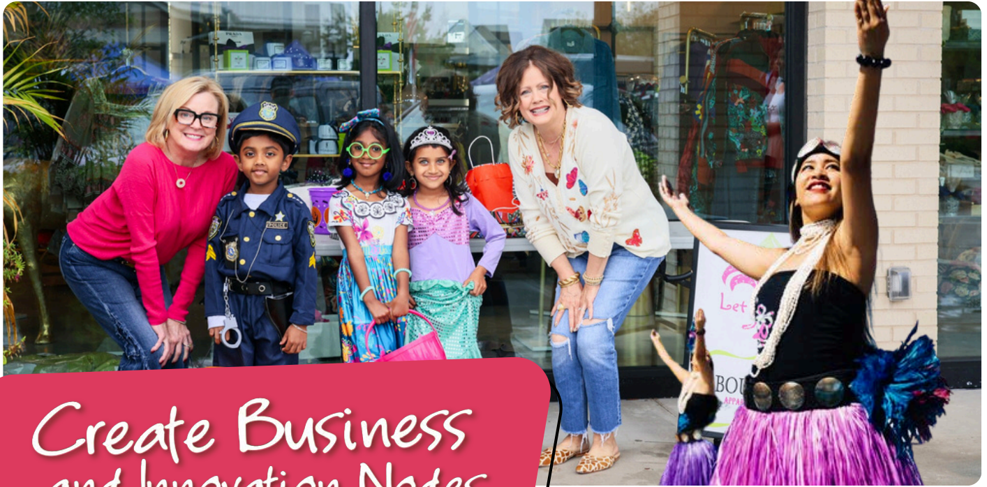
Kaleidoscope, a festival of color, culture, and music is in Old Town Coppell.