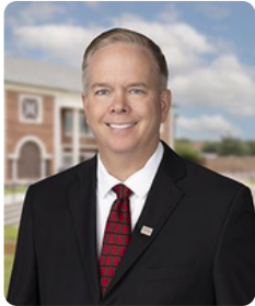
Wes Mays Mayor