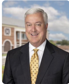
Jim Walker Place 1