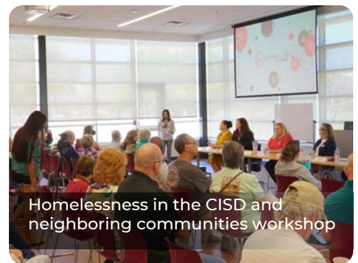
Homelessness in the Cisd and neighboring communities workshop