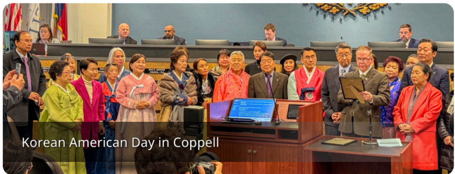
Korean American Day in Coppell