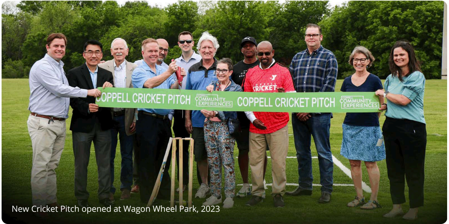
New Cricket Pitch opened at Wagon Wheel Park, 2023