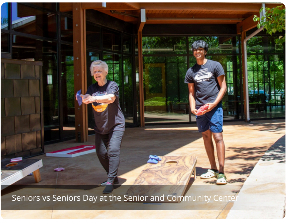
Seniors vs Seniors Day at the Senior and Community Center