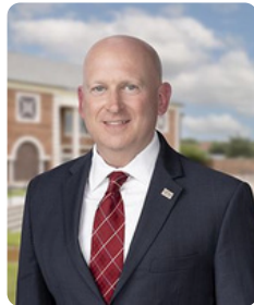
Don Carroll Place 3